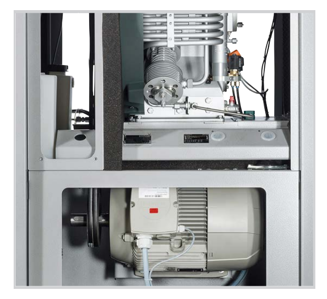
Interior view of VERTICUS: Adjustment of the v-belt is not necessary because of the vertical format and suspended motor mounting.