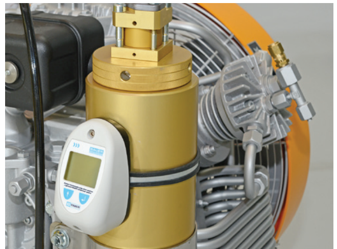
P 31 purification system with B-TIMER – safety at a glance